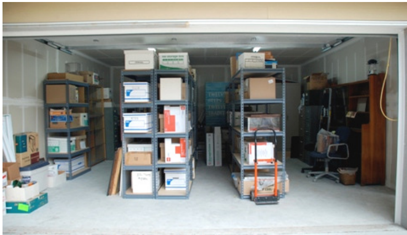
Archives Repository – Open For Easy Browsing

Previously the Oregon Area Archives were housed in several storage units. With the help of an awesome moving crew the archives are now located in a secure building in St. Helens, Oregon. In late February or early March anyone will be able to visit and view the new facility. Please contact archives@aa-oregon.org for an appointment. ▲