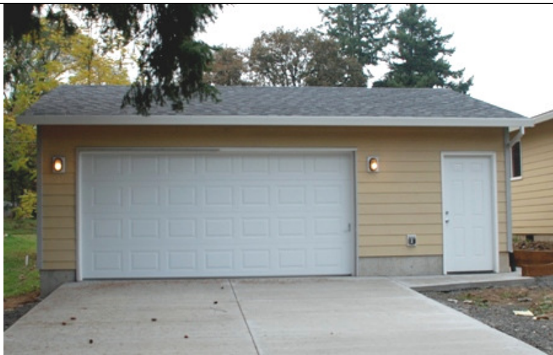
Archives Repository – Closed, Safe & Secure